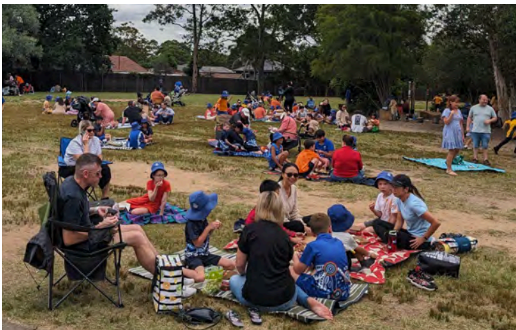
Families and friends enjoyed a picnic lunch together.